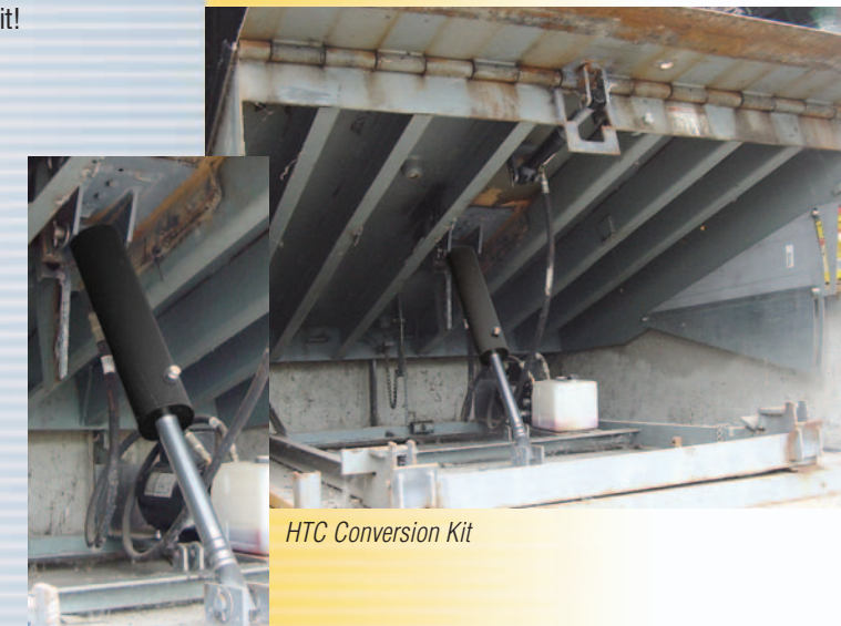
HTC Conversion Kit