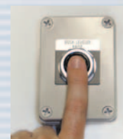
Push-Button Control System