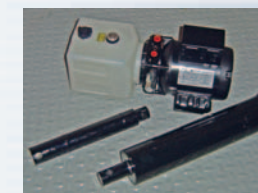
Motor & Cylinders