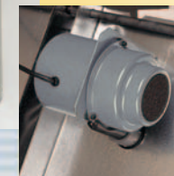
Low Pressure Fan Motor