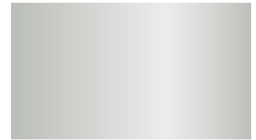
ALUMINUM & INSULATED ALUMINUM