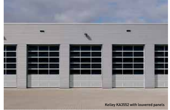
Kelley KA3552 with louvered panels

Kelley KA3552 and KA3502 aluminum sectional doors are constructed of 2" thick extruded aluminum rails and stiles and can be fitted with a variety of full-view glass options, solid aluminum, perforated or louvered ventilation panels. Perfect for automotive showrooms and repair centers, service stations, car washes, fire houses, restaurants, and sports complexes; our aluminum doors create a clean style for any facility. These doors can be mounted stationary or operative as a stylish alternative for al fresco situations. The robust aluminum strut system provides added strength and durability to larger Kelley KA3552 door sizes up to 24' 2", without restricting the viewing area.