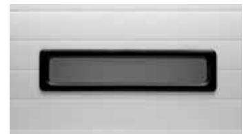
24" X 6" DOUBLE INSULATED ACRYLIC WINDOWS WITH BLACK FRAME