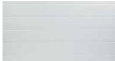
RIBBED PANEL WITH STUCCO EMBOSSMENT