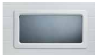
24" X 12" INSULATED GLASS Available with either a black or white frame.