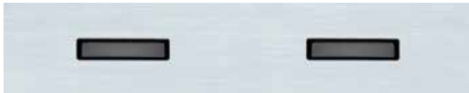
24" X 6" DOUBLE INSULATED ACRYLIC**