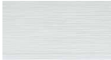
FLUSH PANEL WITH WOODGRAIN EMBOSSMENT