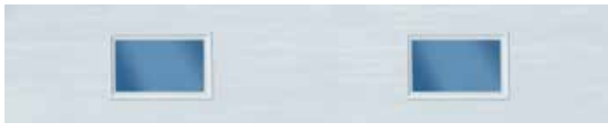
21" x 13" SHORT PANEL*