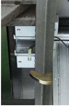
Four Sided Bar Capture