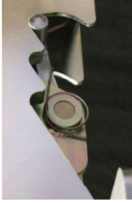
3-position slide lock limits trailer movement

The first powered motor-less trailer restraint lowers overall maintenance requirements, increases reliability, and reduces the total cost of ownership.